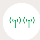
3G/4G GSM ANTENNA