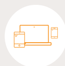
WiFi / BYOD