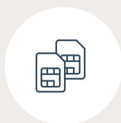
DUAL SIM CARD

High speed internet at sea with extensive coverage up to up to 20 miles offshore