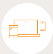
WiFi / BYOD